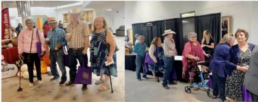
The Senior Citizens group enjoyed an outing to the Fall Festival held at the Sunset Center Art Institute.